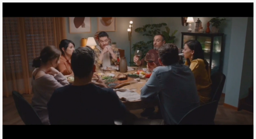
Palm Beach County premiere of Perfect Strangers