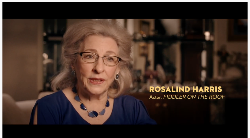
Fiddler's Journey to the Big Screen