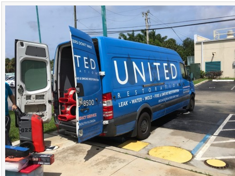
Water Damage Restoration & Mold Remediation Company

This press release can be viewed online at: https://www.einpresswire.com/article/607383111