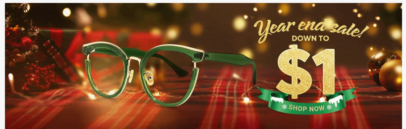
vooglam xmas sale