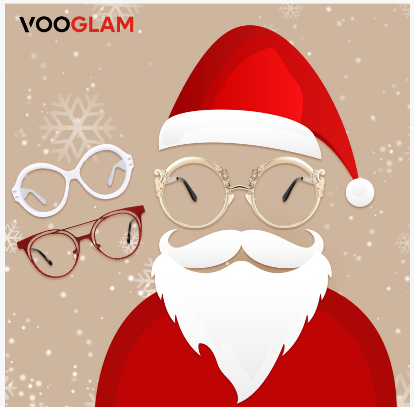
vooglam xmas glasses