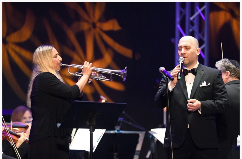
BTC Concert Pic 2022 2