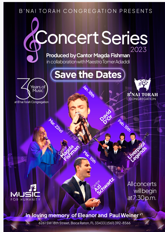
B'nai Torah Congregation Concert Series 2023