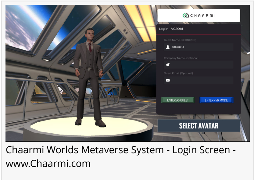
Chaarmi Worlds Metaverse System - Login Screen - www.Chaarmi.com

EINPresswire.com/ -- Chaarmi Worlds Inc. announced today that it has launched the first metaverse offering on the DigitalOcean Marketplace. DigitalOcean is a cloud infrastructure provider that helps builders rapidly build, deploy and scale applications to accelerate innovation and increase productivity and agility.