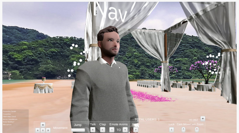
Metaverse Destination Wedding Example - Chaarmi Worlds Metaverse System - www.Chaarmi.com

This press release can be viewed online at: https://www.einpresswire.com/article/607532184