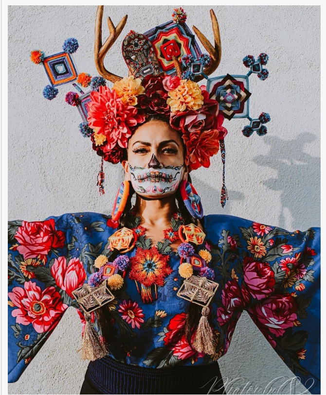
Chicano Art fusion and inspiration of several indigenous cultures