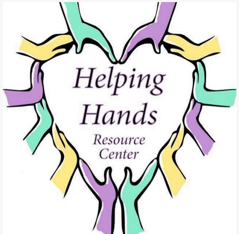
Helping Hands Resource Center a domestic violence advocate non-profit.