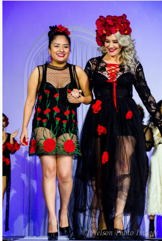
Chicano Elegance Runway

Aranda. Live Entertainment featuring DJs, Singers and musicians. Red Carpet coverage by local