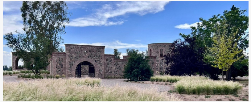
RESTAURANT - COCINA MAESTRA | FOTO: ALICIA SISTERÓ