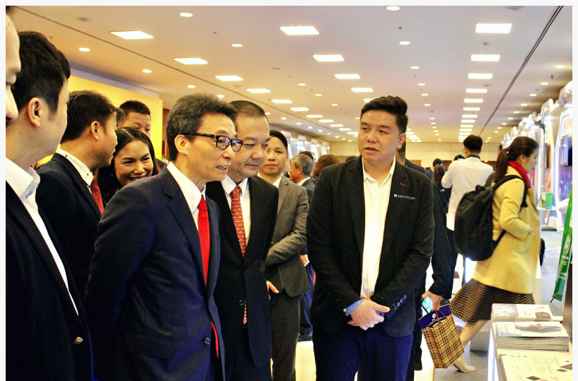
Savvycom introduced SavvyERP to Deputy Prime Minister - Vu Duc Dam

Savvycom participated as one of three enterprises representing the Vietnam Information Technology Outsourcing Alliance (VNITO Alliance), a non-profit organization founded in 2016 with the mission to promote the country's IT industry, connect Vietnamese enterprises with international and local counterparts (such as associations and organization), create a shared platform to foster IT industry talent, and form a bridge between IT enterprises and the country's policymakers.