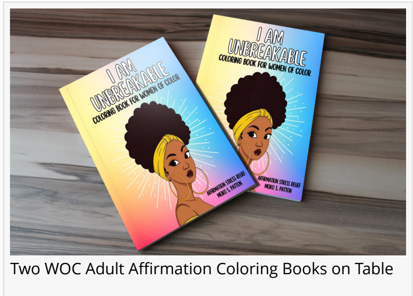
Two WOC Adult Affirmation Coloring Books on Table