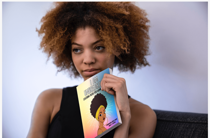
Black woman holds WOC Adult Affirmation Coloring Book