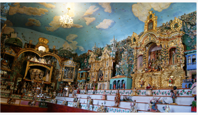
The display of Nativity scenes exhibitions are the highlight of Christmas in Quito

Christmas in Quito offers the possibility of getting to know its traditions, history and culture