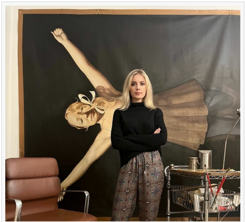
Anna Weyant Becomes Youngest Artist to Join Gagosian Amid Rumors of Romantic Relationship.