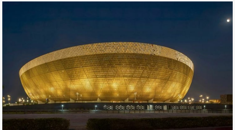
ARCHITECTS: Foster + Partners, Lusail Stadium in Qatar, FIFA 2022 World Cup.