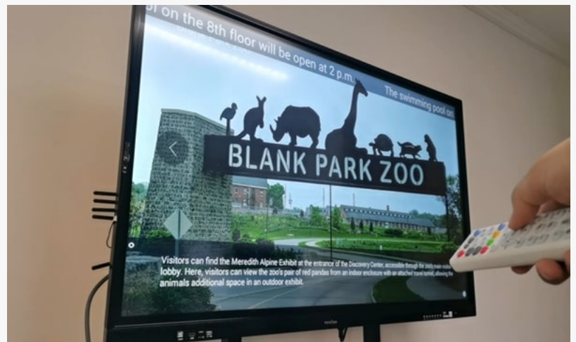
FMUSER hotel IPTV solution nearby services section