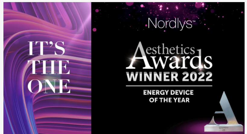
Nordlys Light & Bright - Aesthetic Awards Winner 2022