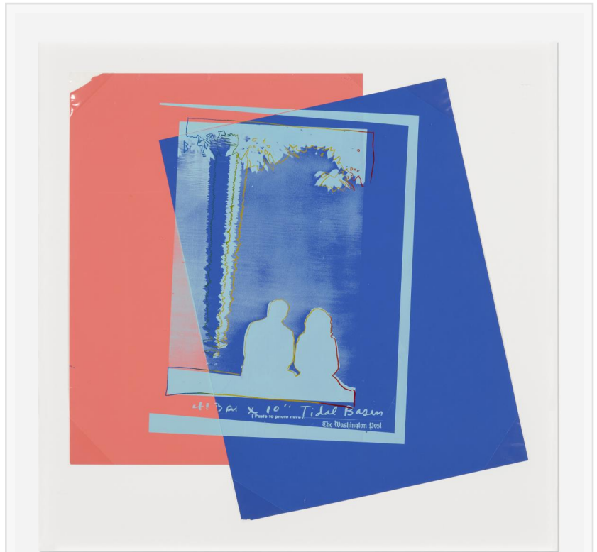
Andy Warhol - Tidal Basin

Leading Dane Fine Art's New Year Sale of Modern & Contemporary Art is Andy Warhol's Tidal Basin, a unique 3D screenprint and collage on paper (lot #37; estimate: USD 91,000 – $126,000). It is a one-of-a-kind artwork showing a couple on a romantic getaway, produced by Warhol in 1983. The iconic Campbell's Soup can painter rose to prominence with his poster-like paintings and screenprints. His painting style and subjects are as