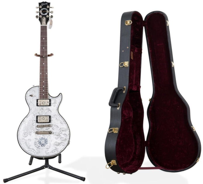
One-of-one Gibson Les Paul Custom model LPSPSC guitar and case, bearing Joel Katz's name mounted to the head and featuring the classical Les Paul electric form (est. $3,000-$5,000).

More than 100 lots of glass and crystal are highlighted by a limited edition robot figure by Kriki (French, b. 1965) for Daum Nancy titled Daumot 163, 16 inches tall, the robot executed in cobalt crystal with gold tone antenna, eyes,