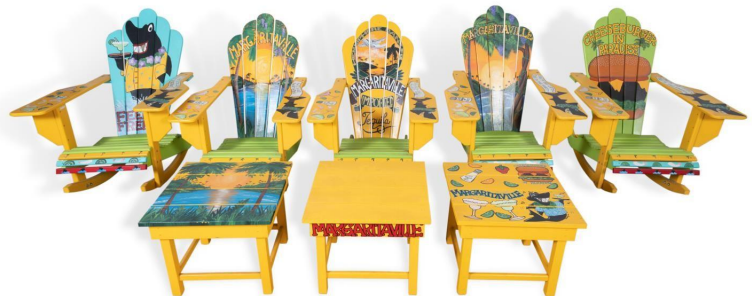
Eight pieces of Margaritaville whimsically painted garden or beach furniture, gifted to Mr. Katz by Jimmy Buffett, comprising four Adirondack chairs and three side tables (est. $3,000-$5,000).