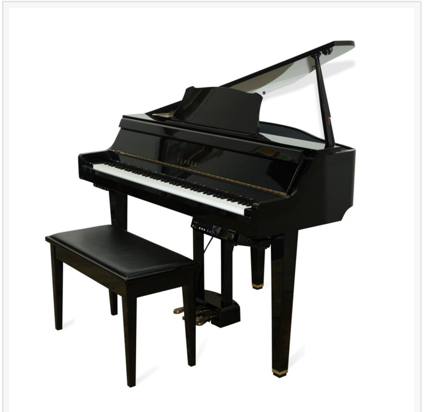
Elton John autographed Yamaha ebony player piano with Disklavier DKC-850 and matching bench, signed by the performer in silver sharpie to the leg of the bench (est. $8,000-$12,000).

The Elton John autographed Yamaha ebony player piano with Disklavier DKC-850 and matching