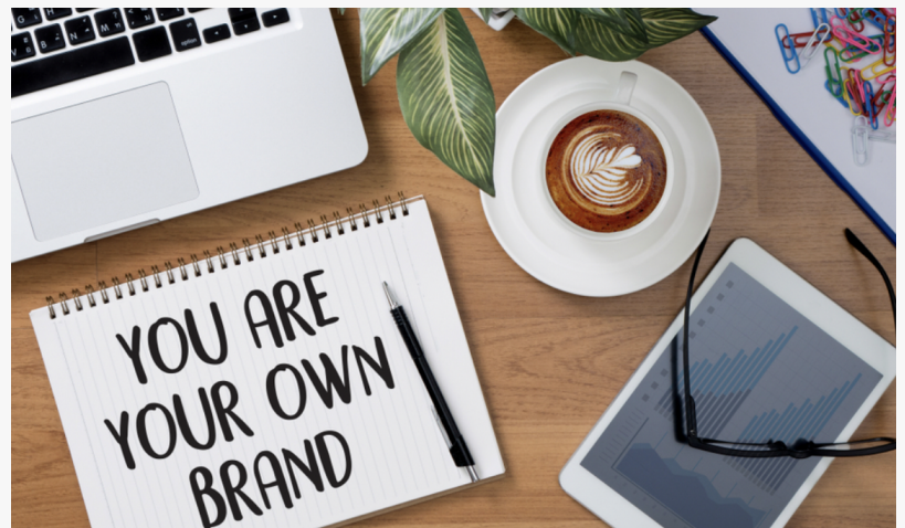
LLC for your Personal Brand