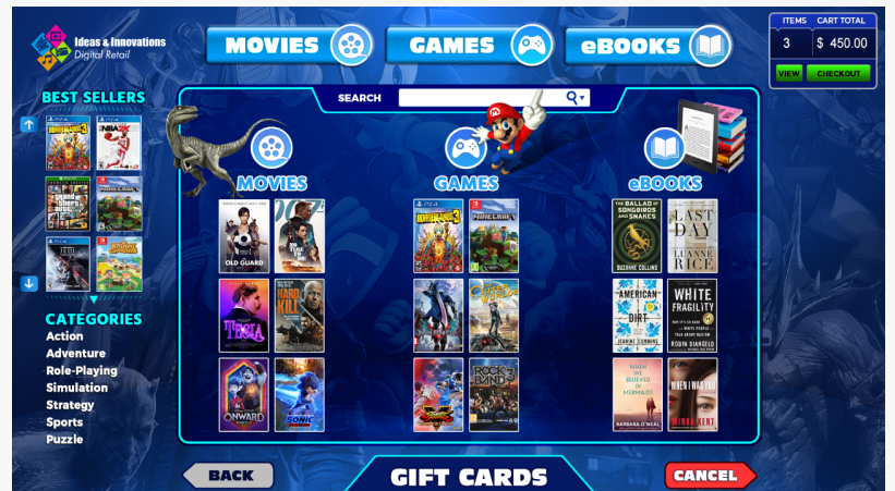
Entertainment Content Options

This press release can be viewed online at: https://www.einpresswire.com/article/608608756 EIN Presswire's priority is source transparency. We do not allow opaque clients, and our editors try to be careful about weeding out false and misleading content. As a user, if you see something we have missed, please do bring it to our attention. Your help is welcome. EIN Presswire, Everyone's Internet News Presswire™, tries to define some of the boundaries that are reasonable in today's world. Please see our Editorial Guidelines for more information. © 1995-2023 Newsmatics Inc. All Right Reserved.