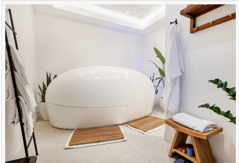
Sensory Float Tank

MedHouse aligns patients with access to the latest integrative and regenerative medical, beauty, and longevity services, equipment, educational programs, procedures, and products through its exclusive VIP experiences. Onsite staff includes certified medical providers, registered dietitians, and health coaches.