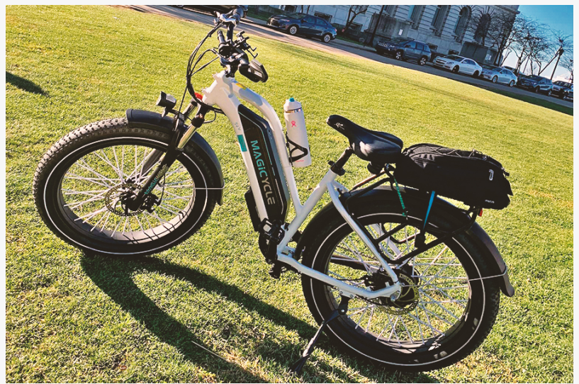
Long Range Magicycle Cruiser

Simply, ebike SUVs mix both performance and comfort. It has the features of various electric bike models, including electric mountain bikes, cargo ebikes, and city commuter ebikes. Just like a regular SUV, ebike SUVs are firm and convenient. They have a large load capacity and a full-suspension system. These features make the ebike SUV one of the best ebike models on the market.