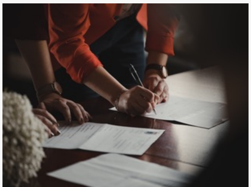
Business Funding Grants