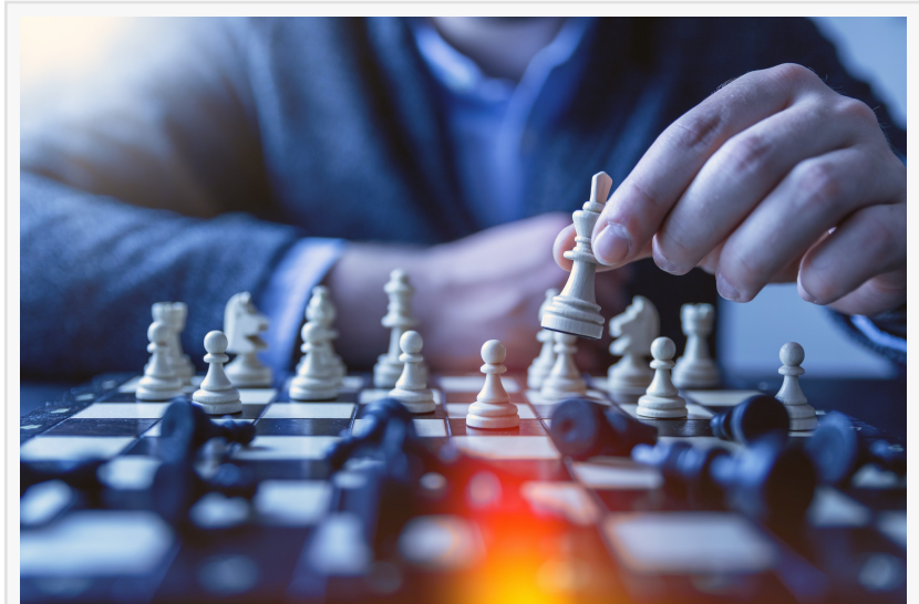
Leadership Development Coaching

Systemic work branched out into the organizational field, leadership development and executive coaching. Business challenges are inherently connected and thus entangled with the personal challenges and ancestral entanglements of the people in the organization. Even the company itself is a system with a consciousness that can be heavily impacted by events that 'seem neutral'.