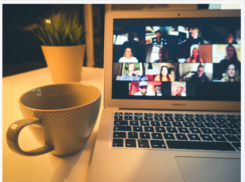
Effective Leadership Communication

As WellCeleration emphasizes solutions that can be implemented in a speedy manner by accelerating what is working well, systemic constellations can be a very swift approach to put things right. One session of only 2-3 hours can effectively change the course of leaders and their teams, or big projects, from heading for disaster to victory, raking in measurable bottom line results of more profit and growth.