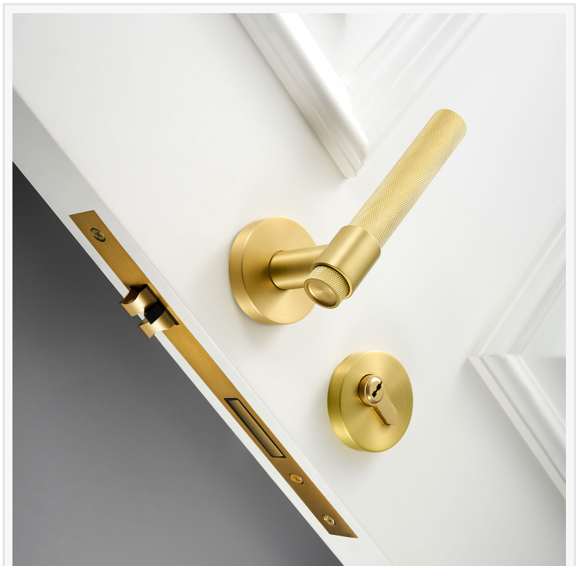
Knurled Gold Door Handles