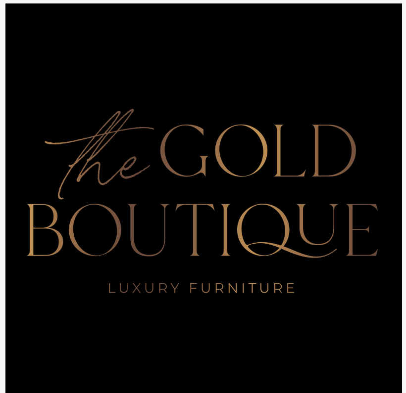
The Gold Boutique Furniture