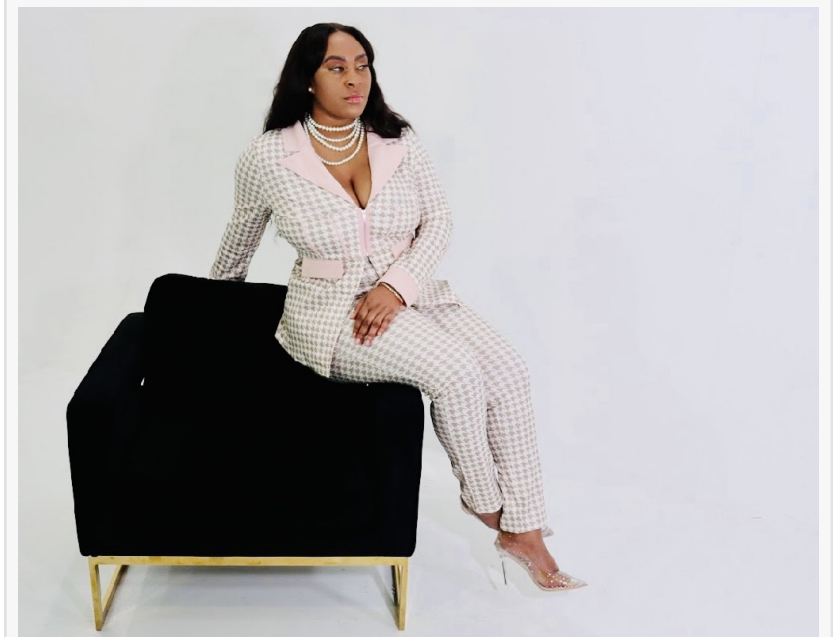
New Wealth Coach Leads Houston