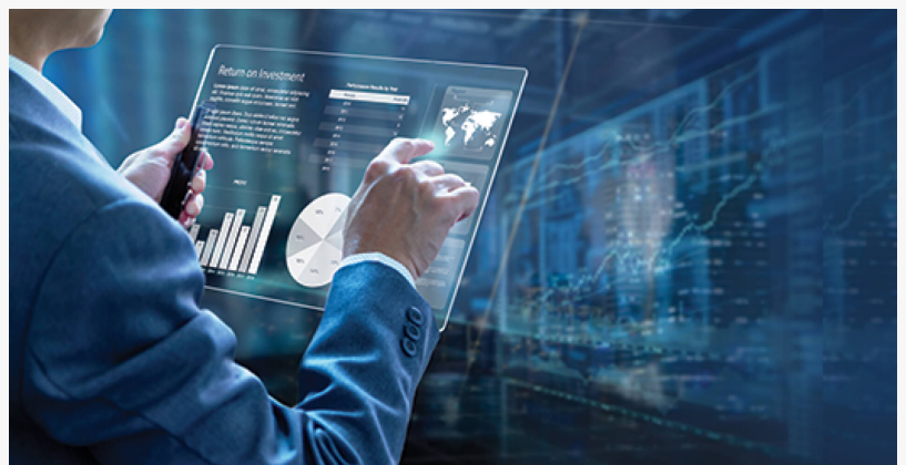
Enterprise Governance, Risk And Compliance Software Market