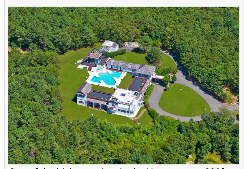
One of the highest points in the Hamptons at 300ft elevation

As part of Sotheby's Concierge Auctions' Key for Key<sup>®</sup> giving program in partnership with Giveback Homes, the closing will result in a new home built for a family in need.