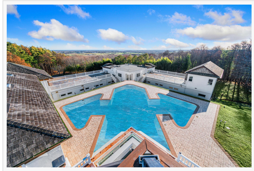
Views from the Atlantic Ocean to Peconic Bay