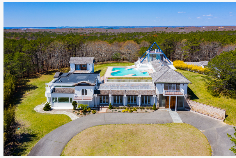
9ac property & adjacent 6±ac lot for potential buildout

The one-of-a-kind pool—as seen in Notorious B.I.G's. music video for 'Juicy'—is surrounded by approximately 5,000 square feet of rooftop deck, which proves ideal for hosting a party of any size with views from sunrise to sunset. The nine-acre existing property and an adjacent nearly six-acre lot, prime for potential build out, sit at approximately 300-foot elevation. Surrounded by approximately 15 acres of preserved land, the properties offer truly unparalleled privacy, all while framing unobstructed panoramic views from the Atlantic Ocean to Peconic Bay. With potential clearing allowance for