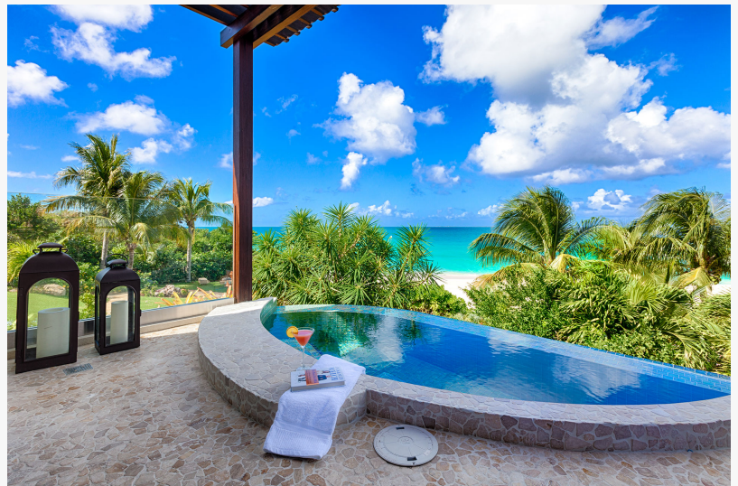
Outdoor entertaining with expansive views & lush gardens