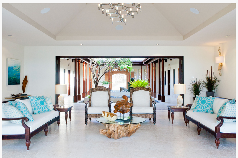
Exceptional indoor-outdoor flow

It’s easy to understand why this villa is named Nevaeh (heaven spelled backward). This contemporary Balinese-style estate offers exquisite finishes across the main house and guest villa with exceptional indoor-outdoor living. The Balinese aesthetic is grounded in nature and expressed through walls of glass that disappear to let the expansive beach views and sea breeze flow through the estate. Your interior space flows seamlessly into your outdoor entertaining area. Meander the mature grounds and discover the perfect outdoor patio for your mood and take in one of Anguilla’s most exclusive beaches. Whether you choose the intimate beachside deck, the alfresco dining patio, or the poolside lounge, the villa will graciously accommodate both large groups or couples with the combination of intimate and expansive gathering areas. Nevaeh’s gorgeous landscaping and ocean vistas enchant you and your guests from every vantage point.