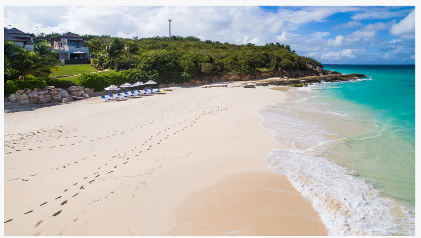
Serene and private Long Bay

Conditions for full details. For more information, including property details, exclusive virtual tour, diligence documents, and more, visit casothebys.com or call +1.212.202.2940.