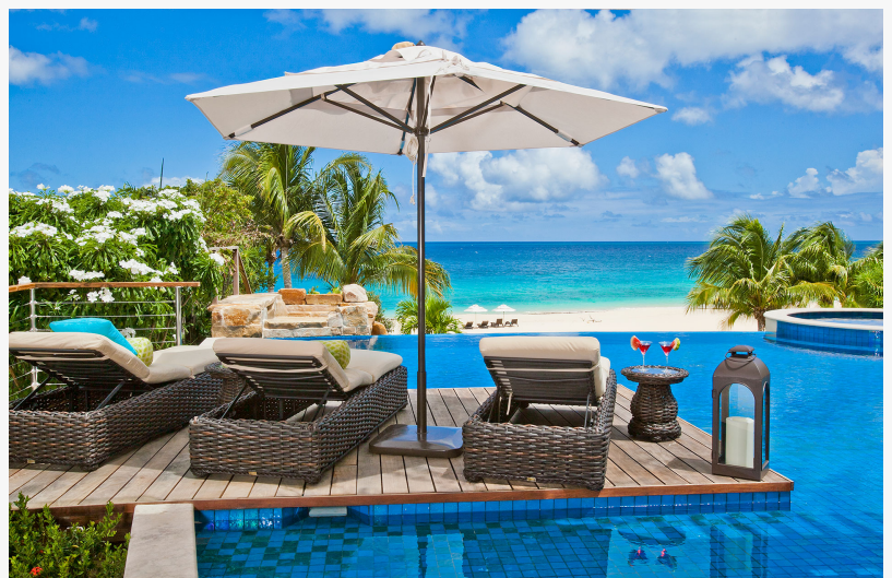
Negative edge swimming pool and hot tub