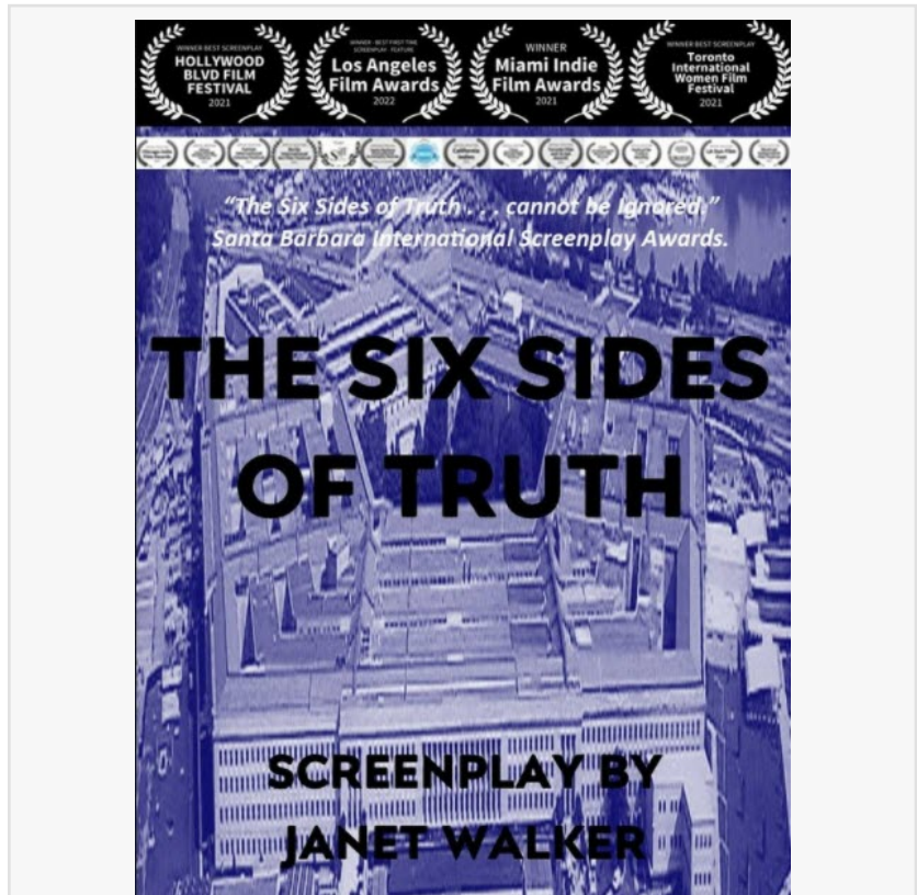
The Six Sides of Truth Unveils New Poster

WILDsound Film and Screenplay Festival said, "The Six Sides of Truth is filled with action, thrills, deception,