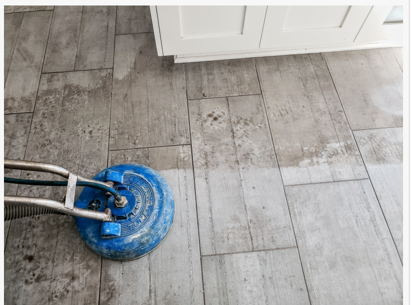
Tile and Grout Steam Cleaning

Next, we recommend using a mild detergent and warm water to scrub the tile and grout. When it comes to maintaining tile and grout, it is important to use the appropriate cleaners. Avoid using harsh chemicals, as these can damage the tile and grout. Some folks swear by baking soda cleaners, but we recommend being cautious with this as well. Baking soda is an abrasive and can scratch the floor and leave residue behind if not rinsed well.