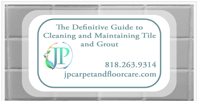
guide to cleaning and maintaining tile and grout

It is important to select the right cleaning method for the specific tile and grout to ensure the