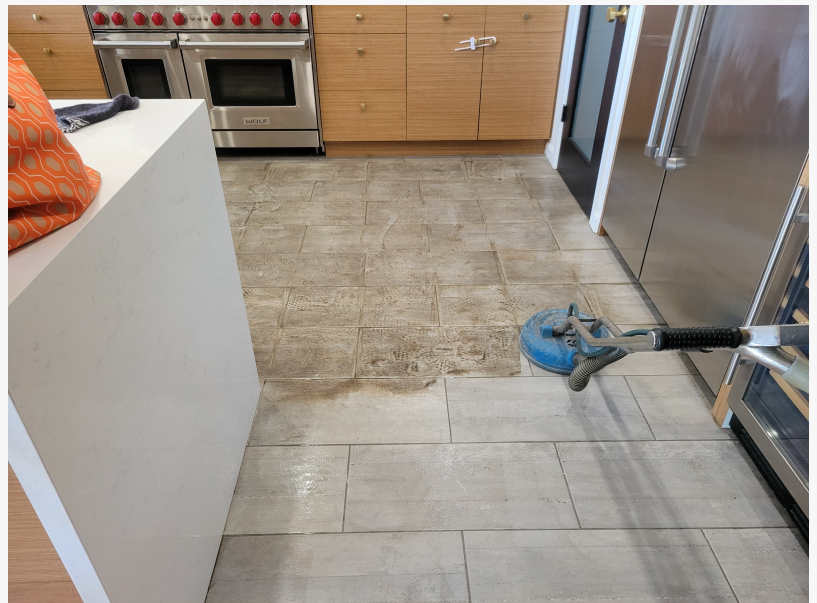
Tile and grout cleaning