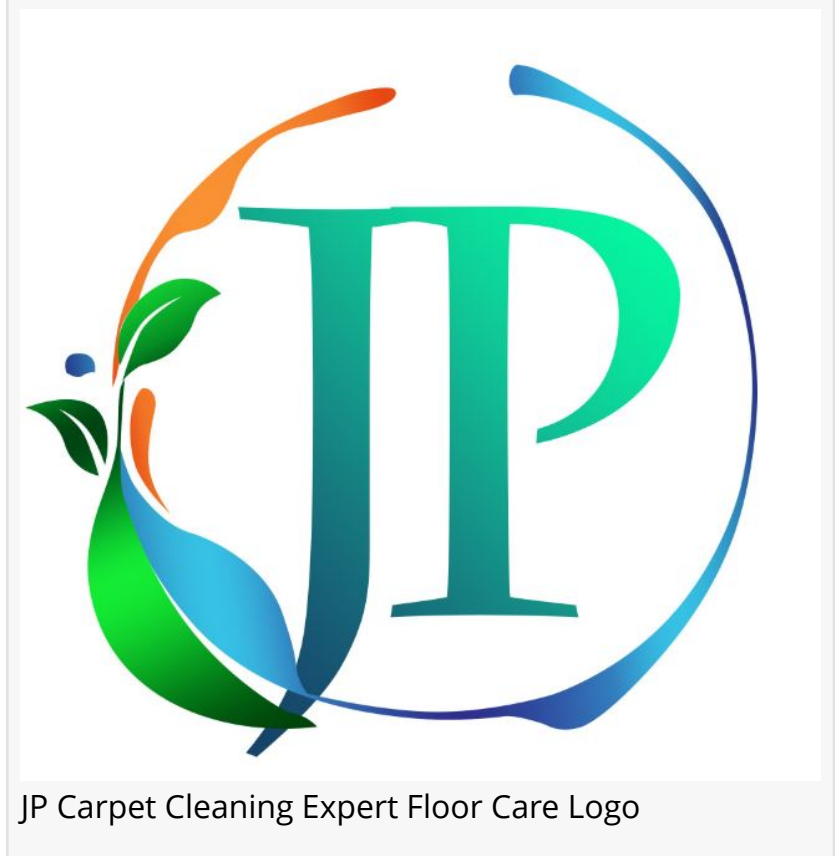
JP Carpet Cleaning Expert Floor Care Logo