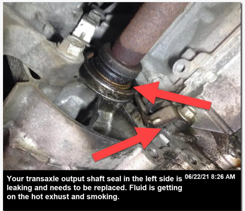
Inspection Image showing condition, cause and correction

The inspection includes research to address the customer's reason for making the appointment, documenting the state of vehicle health using images, notes, videos, and recommended actions in a language the layperson can quickly understand and use as reference. Then, just like a doctor's visit starts always with taking the vital signs, a Digital Inspection result covers all important conditions of the vehicle; typically a 50-point inspection. Each condition gets notes. Plus, to receive a Digital Auto Checkup certification, the inspection results must include topics with mandatory documentation using images and videos. The images will be edited to show the condition, cause, and corrective action(s) to the layperson. For instance, embedded in this article is a typical example of the symptom "my car smells like burning oil".