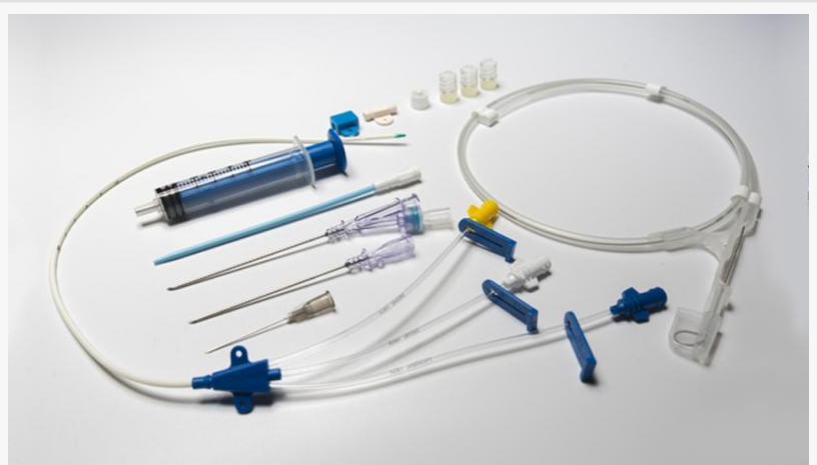
Central Venous Catheters Market

compound annual growth rate (CAGR) of approximately 5.90 percent over the forecast period. The report analyzes the Central Venous Catheters market's drivers, restraints/challenges, and the effect they have on the demands during the projection period. In addition, the report explores