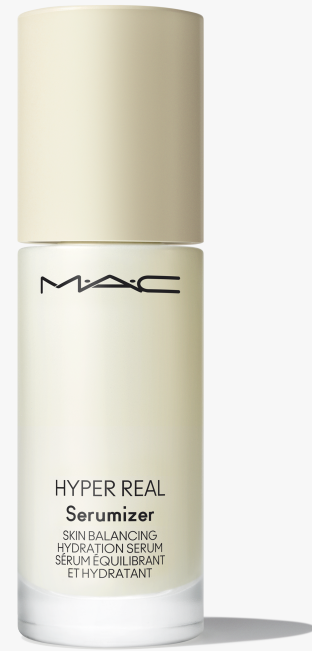
MAC Hyper Real Serumizer

Additionally, Mango and Avocado Butters help to leave skin feeling soft, nourished and conditioned. Non-greasy and non-pilling, the lightweight, breathable texture absorbs instantly for smoother, better makeup application, keeping makeup looking fresh for 12 hours. Tested on all skin tones.