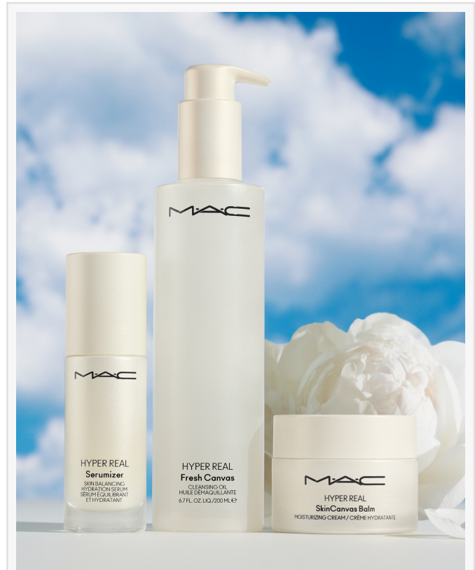
MAC Hyper Real Collection

Both the Hyper Real Serumizer™ and Hyper Real SkinCanvas Balm™ are powered by M·A·C's Pro-4 Power Infusion Matrix™ that features resilient and rare Japanese Peony Extract, skin-refining Niacinamide, hydrating and plumping Hyaluronic Acid, and restorative Ceramides to deliver immediate and long-lasting results. More specifically: