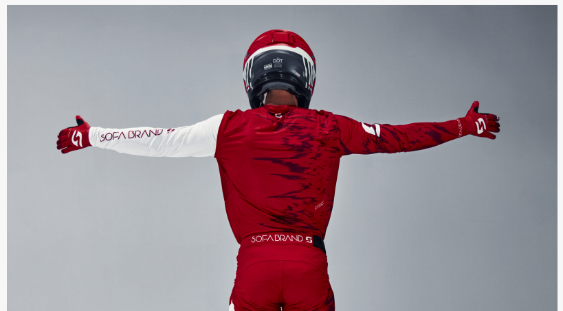
Sofa Brand MX Wave Red featuring ProZip® Technology