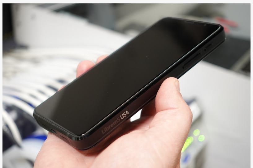
Purism will demo its Librem 5 USA