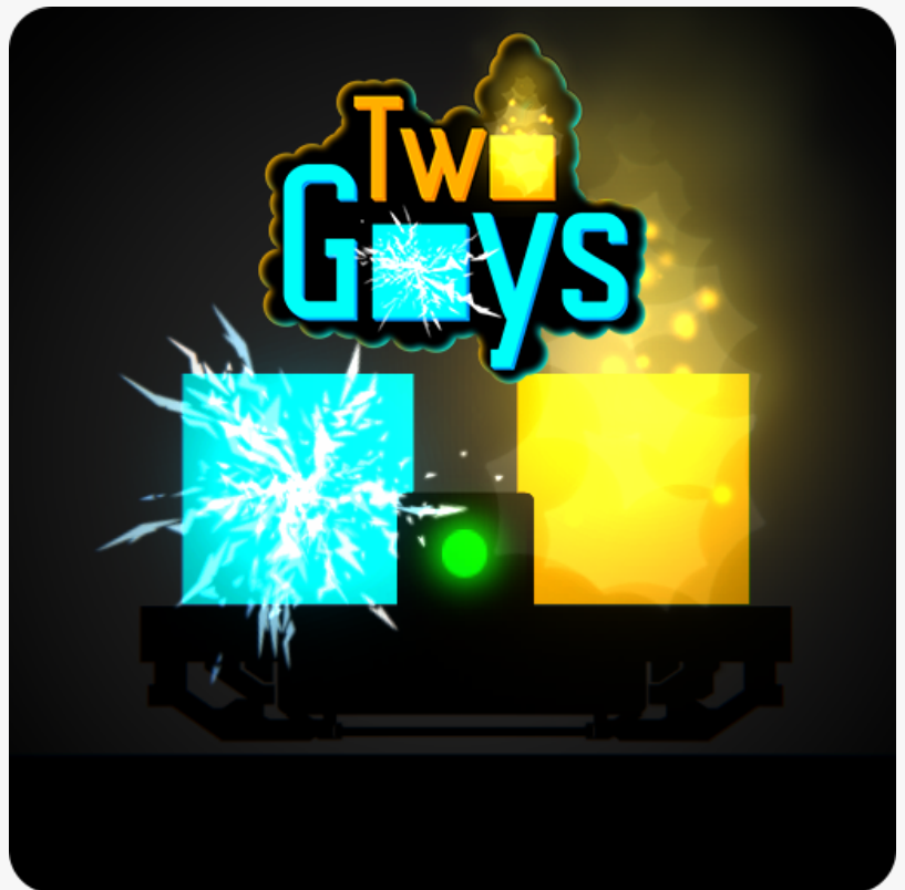
Two Guys: Puzzle, Platformer