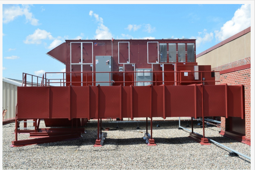
Pro-R Duct System is the Top Choice for Commercial and Industrial Applications

Pro-R is available in four different product lines- Pro-R Rectangle, Pro-R Round, Pro-R Double Wall, and Pro-R Indoor. Pro-R is garnering recognition as being lightweight, durable, thermally and energy-efficient, and having an aesthetically-pleasing design with 20+ color options.