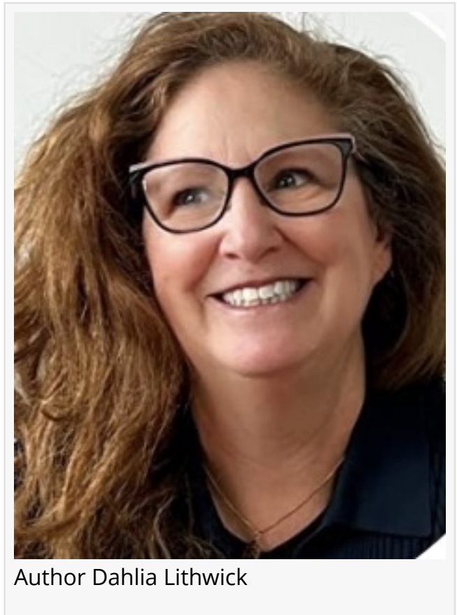
Author Dahlia Lithwick

In 2018 Lithwick received the American Constitution Society's Progressive Champion Award and the Hillman Prize for Opinion and Analysis. She won a 2013 National Magazine Award and has been twice awarded an Online Journalism Award for her legal commentary. She was inducted into the American Academy of Arts and Sciences in October 2018.