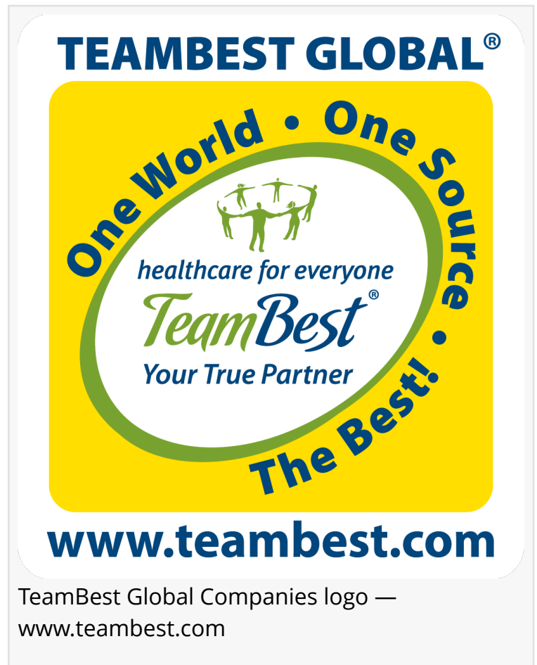
TeamBest Global Companies logo — www.teambest.com

B-15 will produce about 3.6 Ci of Tc-99m in 3 hours at 300 uA. This amount may be sufficient for