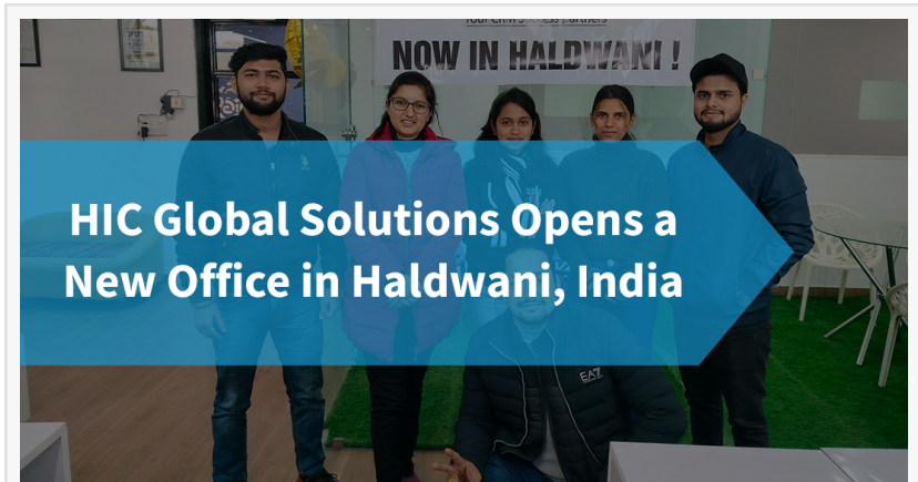
Hic Global Solutions New Office, Haldwani

"India's booming economy opens up immense growth opportunities, making it a major market for Salesforce products. The Haldwani office will strengthen our presence in the region, helping