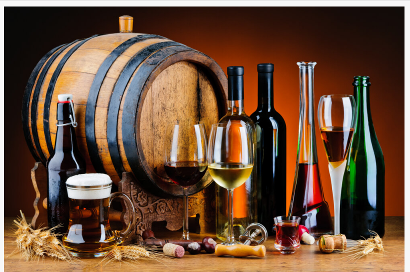
Alcoholic Beverages Market

Furthermore, the outline of healthy breweries and spirits will provide additional potential opportunities for alcoholic beverage market growth in the coming years. However, the rise in the alcohol industry as a result of rising health concerns could provide additional difficulties to the market's growth in the near future. This alcoholic beverages market report covers recent developments, trade regulations, import-export analysis, production analysis, value chain optimization, market share, the impact of domestic and localised market players, emerging revenue pockets, changes in market regulations, strategic market growth analysis, market size, category market growths, application niches and dominance, product approvals, product launches, and more.