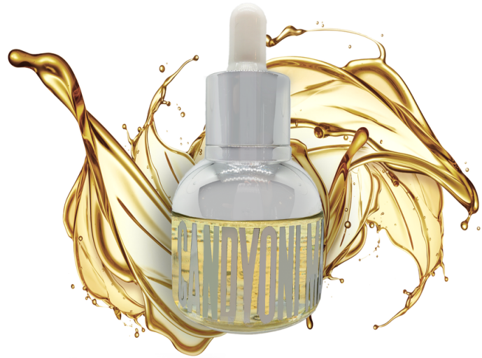
Candyoni Maison Lickable Oils

Pay later pre-orders are available now for the Sleazy Greetings X Candyoni Maison collaboration. Use code '2023' at www.Candyoni.Maison for 25% off your first order. Gift Cards excluded. Order today and pay when your order ships! All pre-orders are handled by PurpleDot. At checkout, clients will enter card details which will be used to pay for the pre-order at the time of shipping. Clients can fully manage their pre-orders all within the PurpleDot platform and check the status on the Candyoni Maison website. Cancel before the order ships for a full refund. Payment information is processed securely by Stripe. Pre-Orders are expected to ship April 30, 2023 - July 31, 2023. If desiring oils sooner, reach out to Candyoni Maison directly, as limited in-stock oils may be available for Valentine's Day. Customers are encouraged to visit www.SleazyGreetings.com if desiring a greeting card right away.