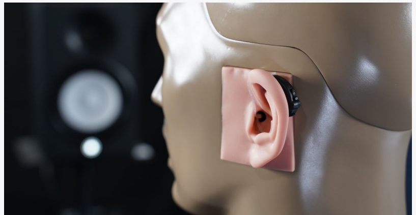
HearAdvisor's acoustic manikin measures and records hearing aid output