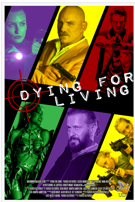
Dying for Living Poster 1