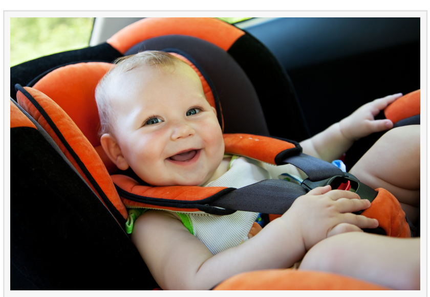
NovoaGlobal saves lives in 2022 and Looks forward to creating safer communities in 2023

"We're so proud of all that we've accomplished in 2022 to create safer communities. We know many families and friends were together in 2022