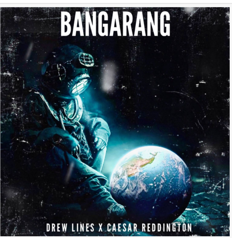
Bangarang is released on all major music platforms worldwide

Additionally, in April of 2022, Drew Lines "15 Minutes of Fame" featuring <u>Scotty Austin</u> charted at #25 in the Nation on the NACC Top 30. Aptly named, the song managed to make 11 regional charts across the US, including four #1's, including a #1 in the Heavy rock category at WERU in East Orland, Maine. Also, the single topped the charts on M3Radio in Brooklyn, displacing Snoop Dog's "Algorithm" released by Def Jam to the second position, as it takes its place on the #1 spot on the Hip Hop Top 10, #1 on the