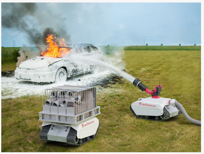
Firefighting robot LeoTronics TrackReitar FFL in work

tirelessly to bring their vision to fruition. Our dedication and passion for robotics have clearly paid off, as they have caught the attention of the top investors in the industry.