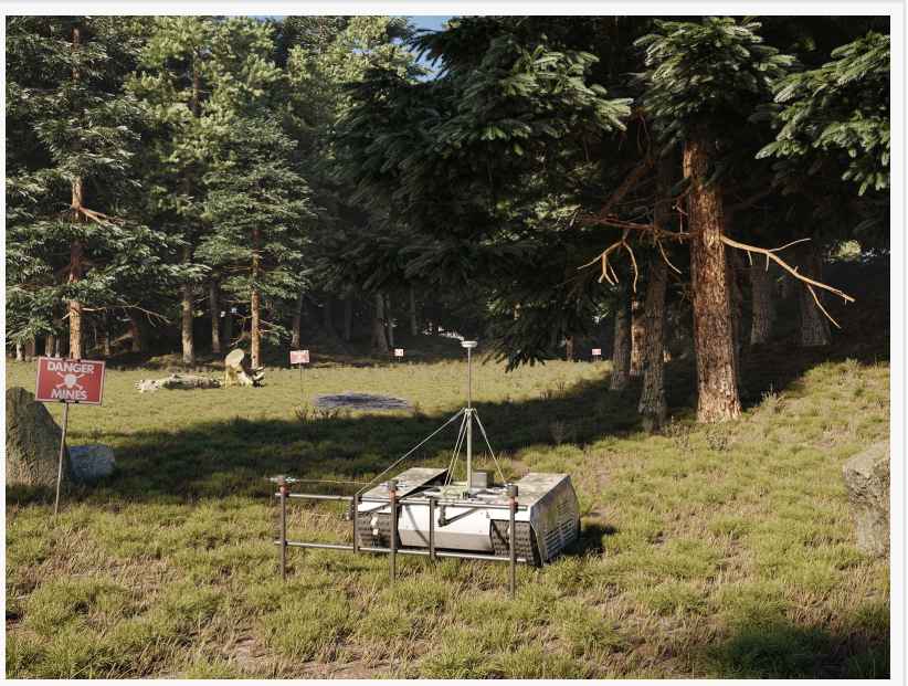
Landmine detection robot LeoTronics TrackReitar CleanField

LeoTronics Robotics raises $10 million in funding to ensure explosive growth and solid earnings for the company and our investors. This new influx of capital will allow LeoTronics to expand R&D efforts and invest in marketing and sales strategies to drive more sales and increase market share. With a