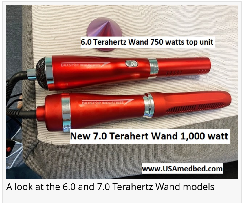
A look at the 6.0 and 7.0 Terahertz Wand models

This press release can be viewed online at: https://www.einpresswire.com/article/609904941