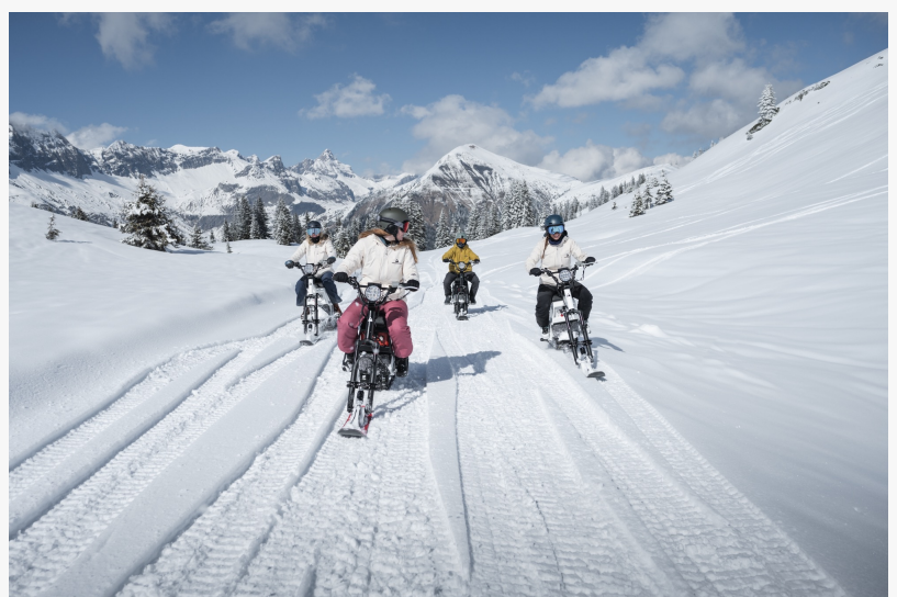
Group of MoonBikes Heading Down the Mountain