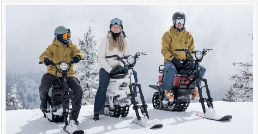
MoonBikes on Mountain

worldwide each year and has the potential for growth in the e-mobility market. "MoonBikes" has already seen strong sales in North America, with private customers and professional resorts partnering with the company to build their own "MoonBikes" Parks for guests. The company has received a customer satisfaction score of 9 out of 10 and is poised to dominate the snow mobility market. "MoonBike" aims to continue its exponential expansion throughout North America and bring its environmentally friendly electric snowtech to areas with snow.