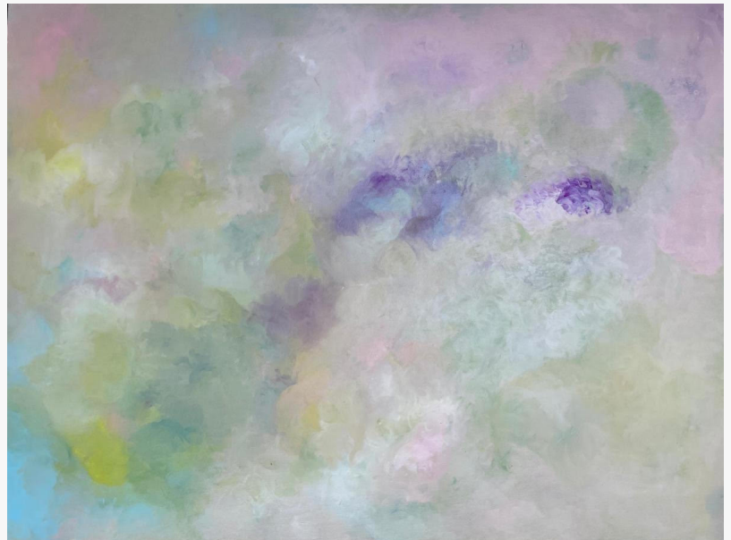
"Breathing Easily," one of 17 paintings in Aida's art exhibit