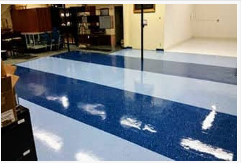
Professionally Waxed VCT Flooring

Additionally, professional VCT floor cleaning services can help to reduce the amount of time and effort needed to maintain VCT flooring. When the wax is clean and fresh, and the proper products are used to maintain the floors, cleaning between services will be a breeze.