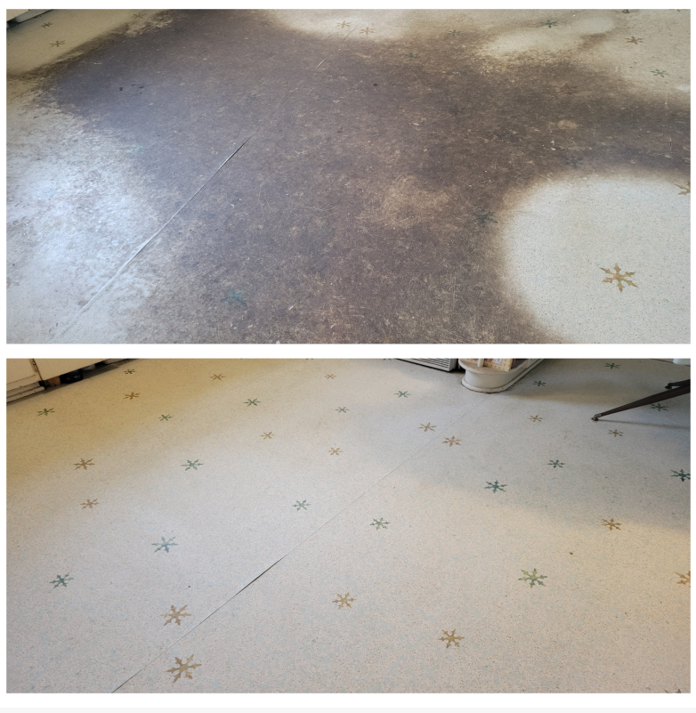
Before and after residential VCT floor cleaning

Once all of the old wax has been removed, the final step would be to apply new wax. We typically