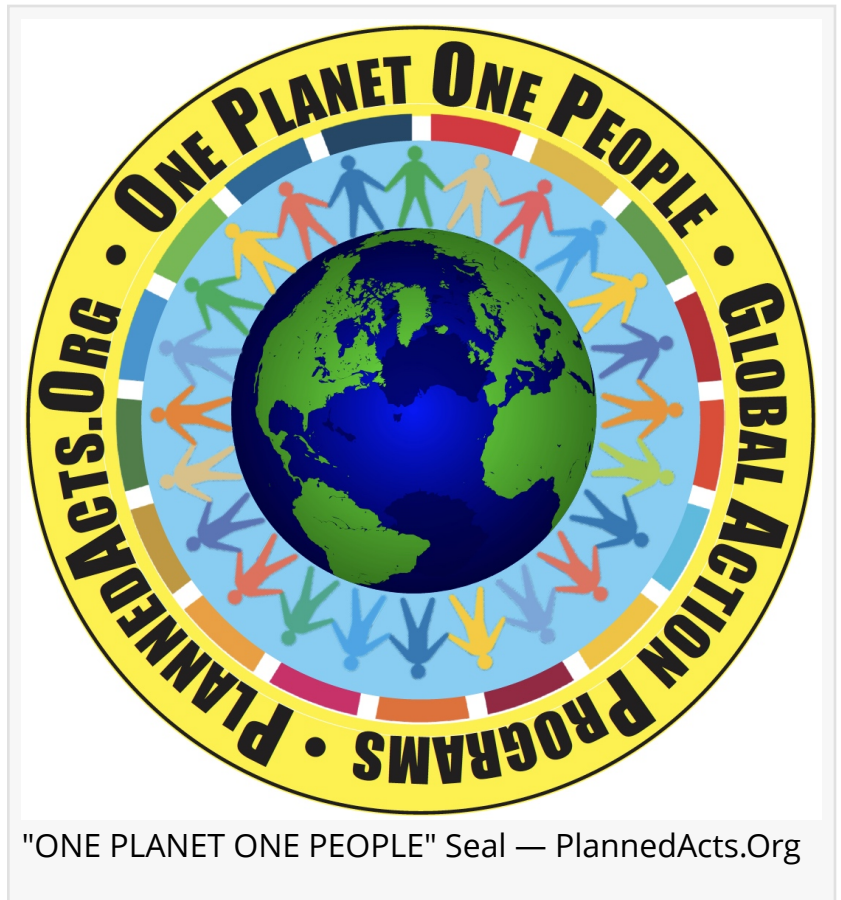
"ONE PLANET ONE PEOPLE" Seal — PlannedActs.Org

Lyle Benjamin Planned Acts of Kindness +1 917-683-2625 Support@PlannedActs.Org Visit us on social media: Facebook Twitter